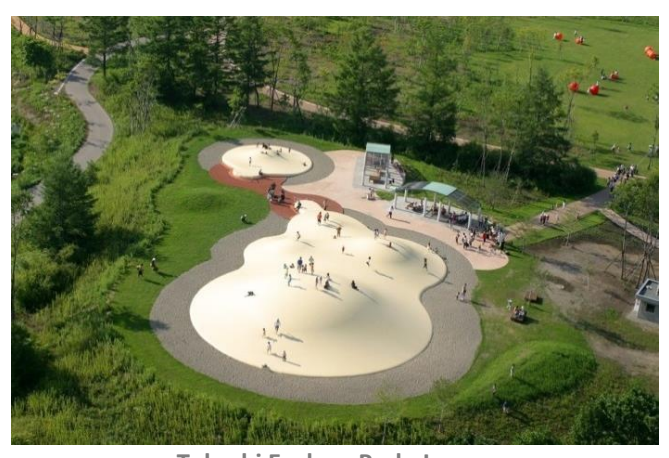
Tokachi Ecology Park, Japan

To enhance the cultural and recreational life of residents and workers in the Docklands, public gardens , parks , walkways and gathering places should be provided, with the riverside location a focus of the planning of public space.